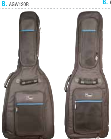
D. AGW120DX D. EGC120DX